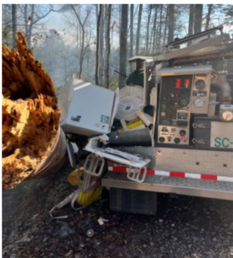
Image shows the angle at which the tree struck the engine.

Two additional firefighters were "observing" from Trestle Road about 20 yards in front of the engine. At the warning yell, they retreated farther away from the front of Engine 603.