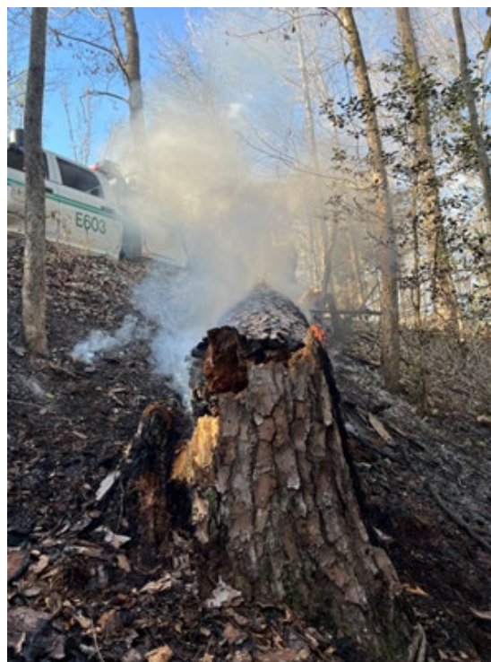
The bole of the hazard tree after it had fallen.

At approximately 1720 hours, the Engine 603 driver placed his hand on the tree, felt movement, and realized that it was falling unexpectedly. He yelled: "Tree's coming down!" to the Holding Boss who was standing directly beside him. Both the Holding Boss and the driver quickly ran up the embankment—just in time to look over and see the tree strike Engine 603.